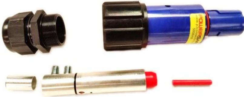
Component Parts of Typical Line Connector (Drain Version Shown)

The recommended assembly procedure has been devised to show step-by-step how to terminate cables to our set screw contact. For a satisfactory termination it is essential that the recommended assembly procedure is used.